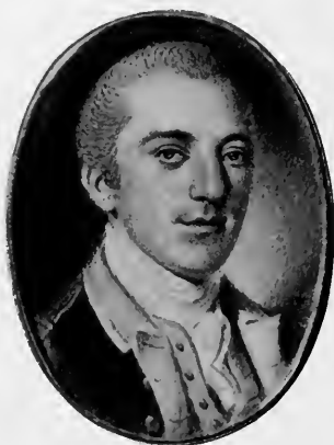
Colonel John Laurens